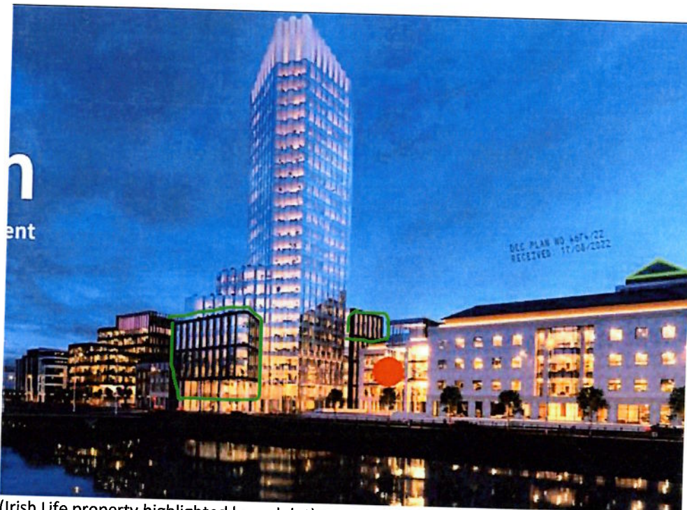
(Irish Life property highlighted by red dot)

Our client is itself a significant developer in the city and would wish, if possible, to support appropriate development on the subject site. Our current issues relate to overbearing and overshadowing (note that public plaza to front of 1GQ is also overshadowed) and we would welcome proposals to mitigate these impacts (such as might be achieved by removal or lowering of the elements highlighted in green below, perhaps including a setback from the quays)?